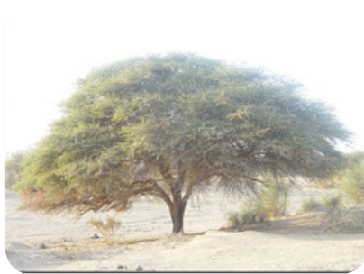
Plant 1: Acacia tortilla