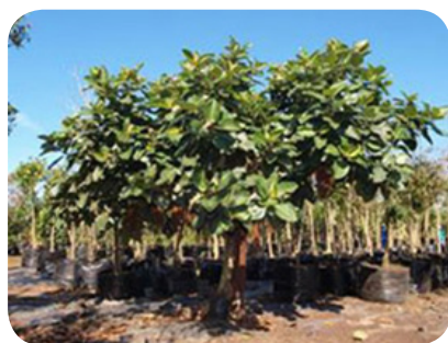
Plate 9: Ficus trichopoda