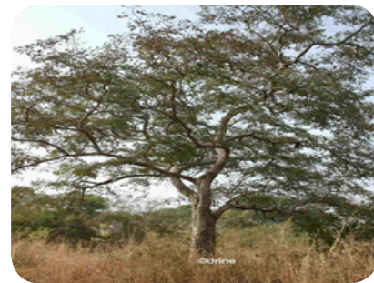
Plant 2: Anogeissus leiocarpus