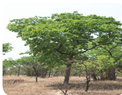
Plate 10: Isoberlinia doka