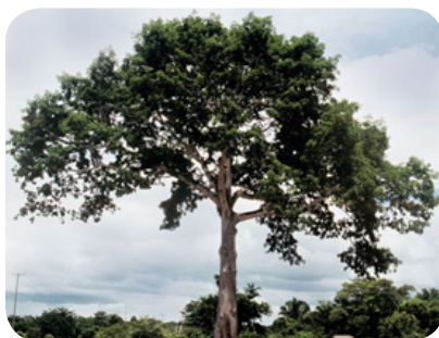
Plant 5: Ceiba pentandra