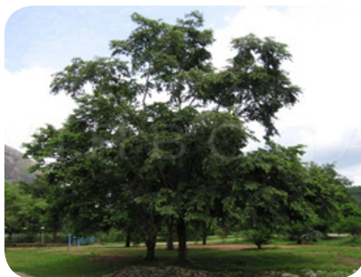
Plant 3: Bombax costatum