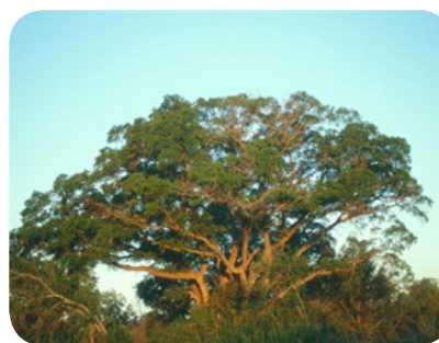
Plate 8: Ficus sycomorus