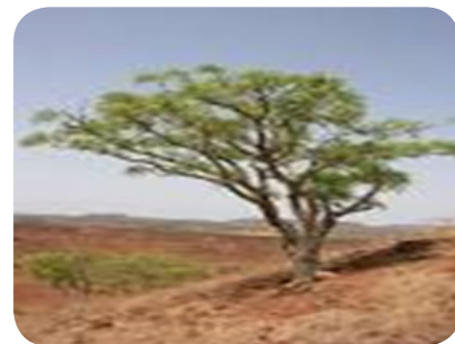
Plant 4: Boswellia dalzielii