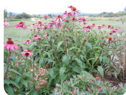
Plant 6: Echinaceae angustifolia