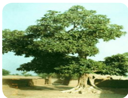
Plate 7: Ficus platyphylla