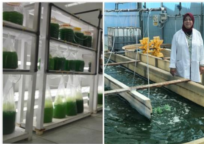
Fig. 1 Modeling of indoor and outdoor microalgae culture in the marine hatchery of NIOF Egypt (2023) offers recommendations for cost-cutting and optimization techniques for microalgae production.

This category serves as the primary prey for larval feeding in the wild. Copepods have a nutritional makeup,