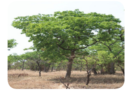
Plate 10: Isoberlinia doka

mL. Accurate weight of extracts was determined on a Mettler AB54 balance.