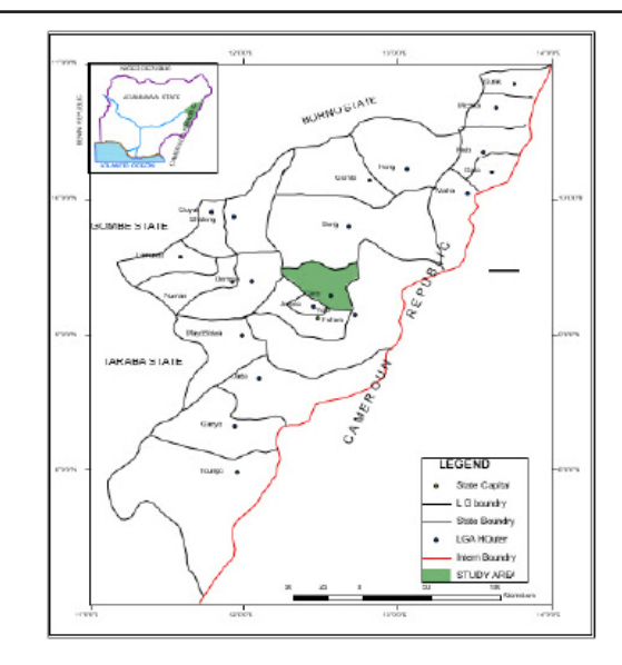
Fig. 1. Map of Adamawa state showing Girei local government.