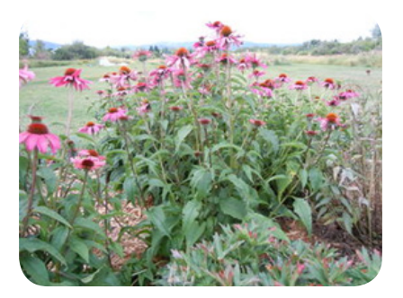
Plant 6: Echinaceae angustifolia

Fig. 2. The photographs of the studied plants (1-6).