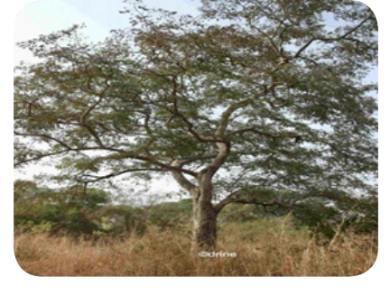
Plant 2: Anogeissus leiocarpus