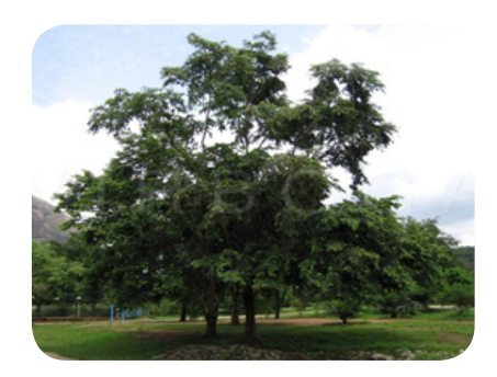
Plant 3: Bombax costatum