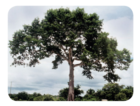
Plant 5: Ceiba pentandra