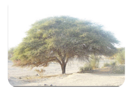
Plant 1: Acacia tortilla

Fig. 1. Map of Adamawa state showing Girei local government.