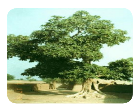
Plate 7: Ficus platyphylla