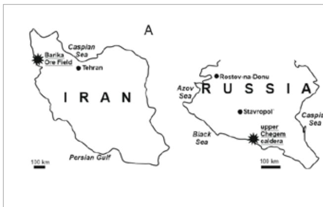
Figure 1. Examples of multi-NMD geosites in northwest Iran (A) and southwest Russia (B).

This study is based on the conceptual analysis of the idea of NMD localities as potential geosites. First, it is demonstrated that these localities should be recognized as geosites and that they require geoconservation activities. Second, the value of NMD geosites is a subject of special analysis. Third, factors limiting the value of NMD geosites have to be taken into account. The IMA list of valid minerals (see http://www.ima-mineralogy.org/Minlist.htm ) is used as an essential source of factual information; moreover, some representative examples from Iran and Russia (Fig. 1) are employed for illustration of some issues linked to NMD geosites.