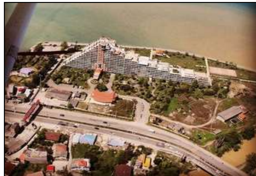
Figure3. Daryaye Chaloo complex