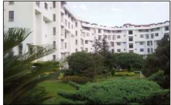
Figure 2. Pardis e Shomal complex