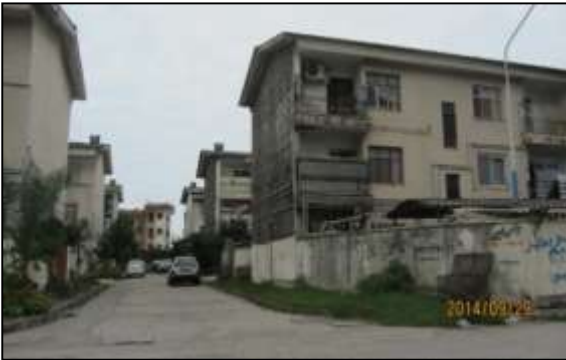
Figure1. Chaharsad Dastgah complex