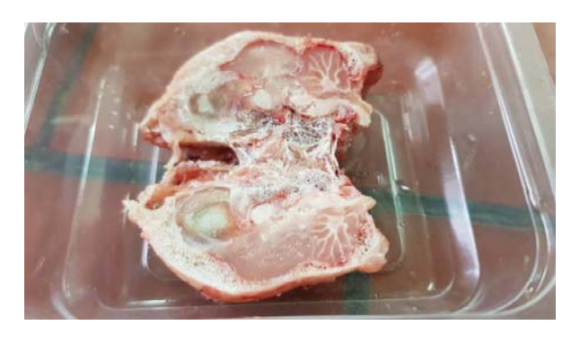
Figure 1 Vertical incision of the chicken head to separate the pituitary gland from the brain at age of 48 weeks

Each frozen head was split into two halves using a sharp knife to separate the whole hypothalamic and pituitary tissues (Figure 1).