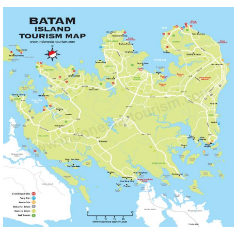
Fig. 1. Batam City Map

The public health center is an organization that capabilities as a middle for well-being improvement, a hub for cultivating local area support in well being area as well as a first-level administration focus that sorts out its exercises in a complete, coordinated, and feasible way of locally living in a specific region.