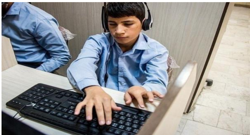
Figure 2. The experimental group using NVDA.

sentence. As soon as they were done with reading each story, the participants were given a 10-item fill-in-the-blank exercise, read by NVDA, to answer it orally. Their responses were audio-recorded. Figure 2 represents how students with VI utilized NVDA independently in the classroom. The participants and the school principal as well agreed to the appearance of their photo in the present article.