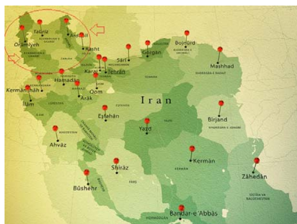
Figure 1 Map profile showing geographic location of different dairy cows. Dairy farms geographically from north west of Iran was candidate for sample collection

For this study, we analyzed the randomly collected data from 30 different samples from different dairy farmers (blood, milk, urine and faeces samples) using routinely available methods. As detailed information, blood, milk, urine and faecal samples were taken from candidate cows for our study at approximately 5 and 18 hours after feeding monitoring. Figure 1 indicated the map profile for the geographic location of sampling from different dairy farms.